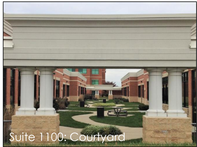
Suite 1100: Courtyard