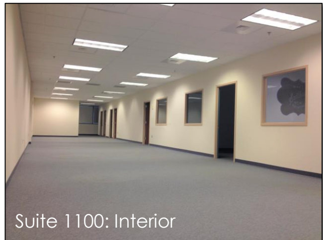
Suite 1100: Interior