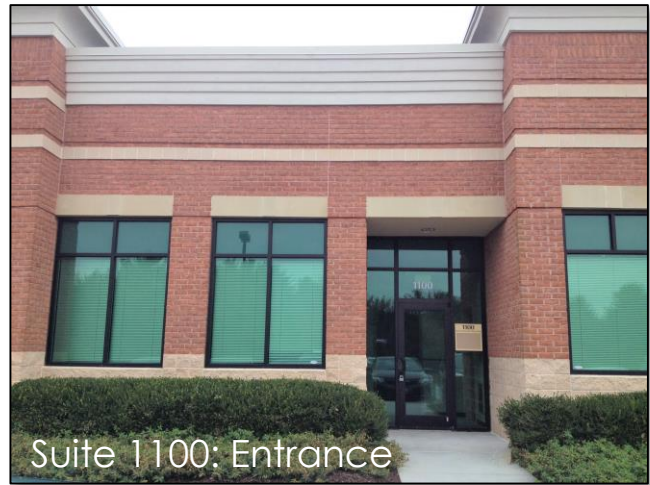
Suite 1100: Entrance