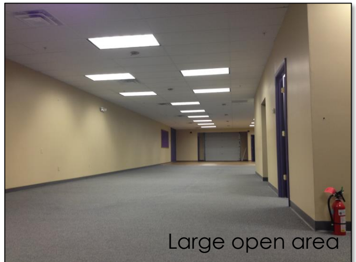
Large open area